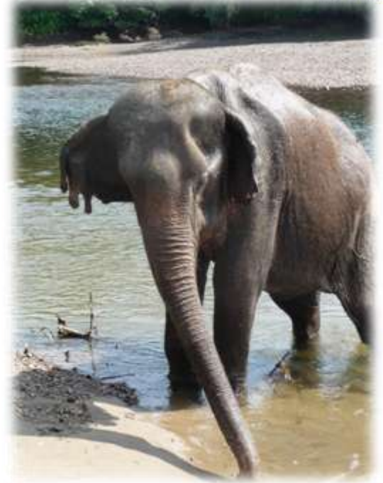
Her first days here at EW 4 years ago